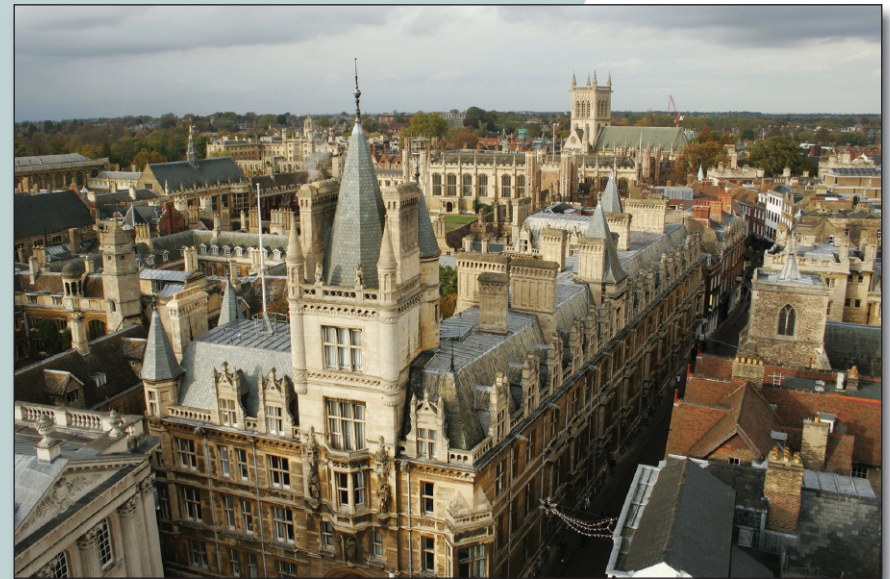
The view from Great St Mary's Church to Gonville and Caius College, and along Trinity Street towards Trinity College and St John's College in the distance.