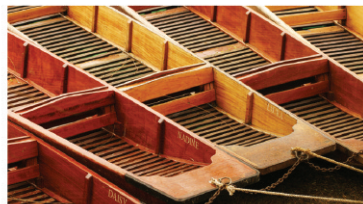
Punting is one of the greatest pastimes in Cambridge.