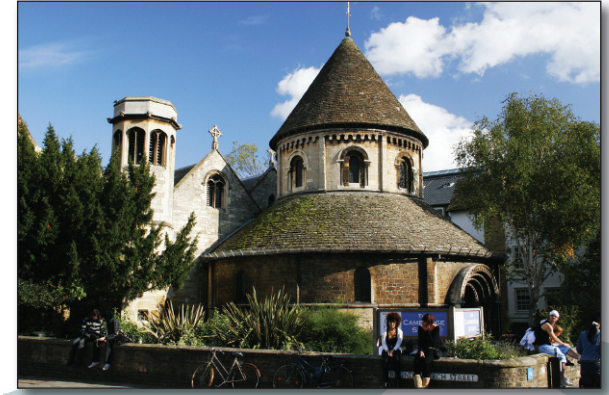
Only four round churches survive in England, and the one in Cambridge on Bridge Street is a fine example.

Tucked away behind the colleges are 'The Backs'. Here, at Clare College, punting along the River Cam is a pleasant way to spend a sunny afternoon.