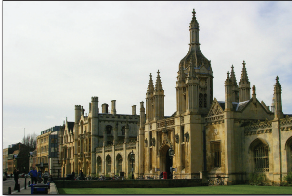
The impressive frontage of King's College.