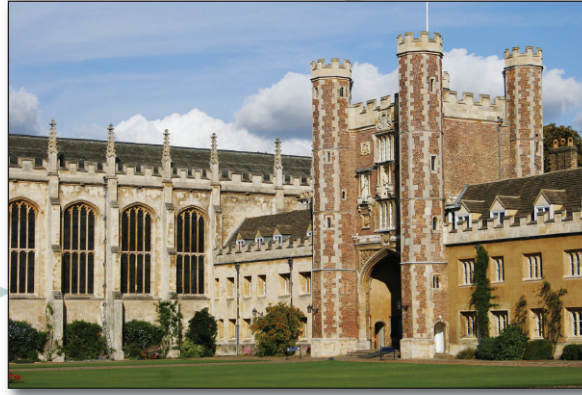
Trinity College's Great Gate, from the Great Court.